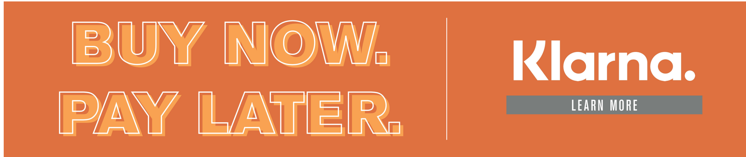
KLARNA (1000x209) WEB