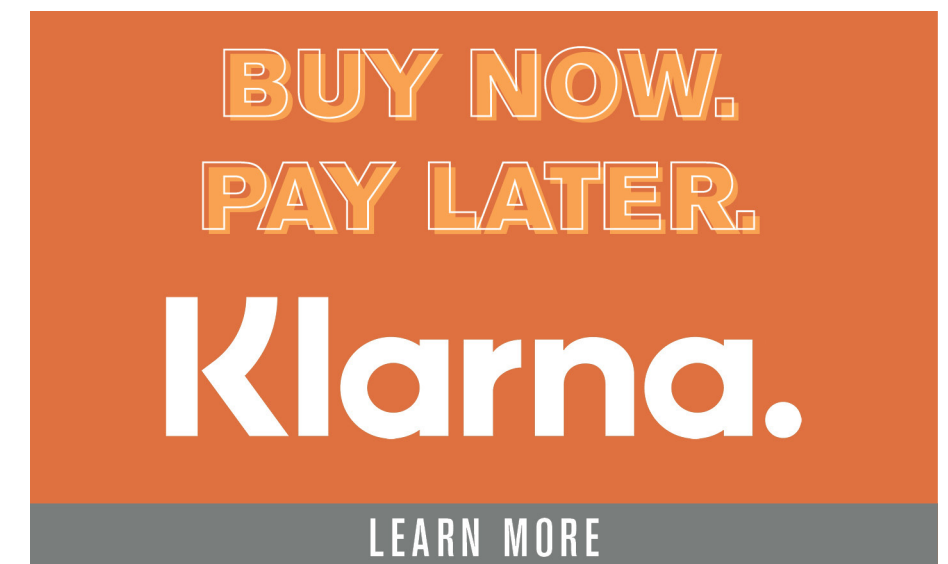
KLARNA (340x209) WEB